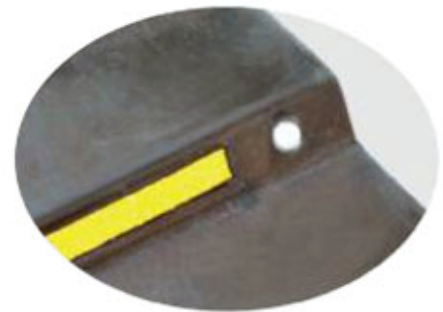
Double Reflector: Sheet and Cat-Eye